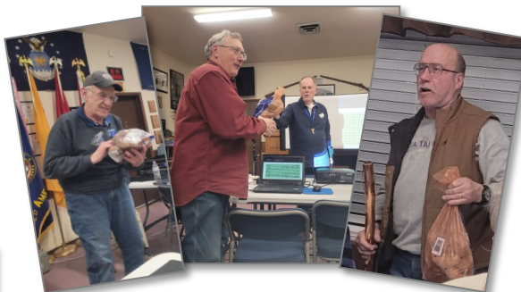
This SPUDs for you!